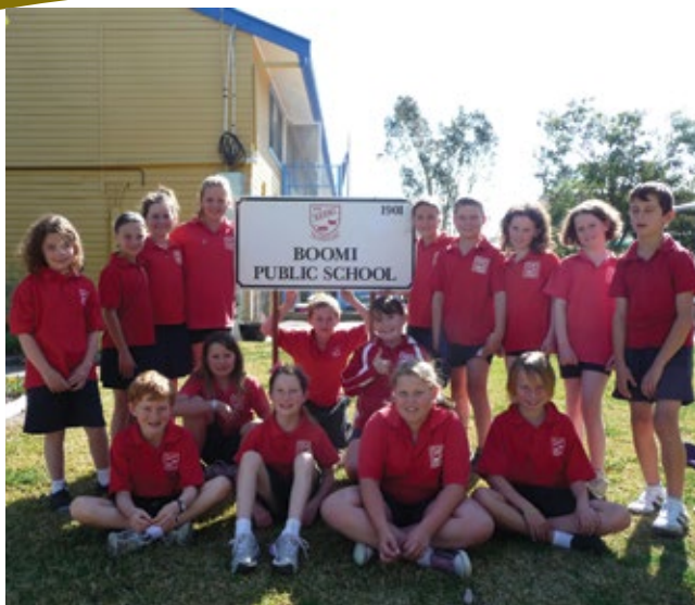
Year 3-6 Class Boomi Public School, 2012

peek designs Environmental & Educational Designs & Publications