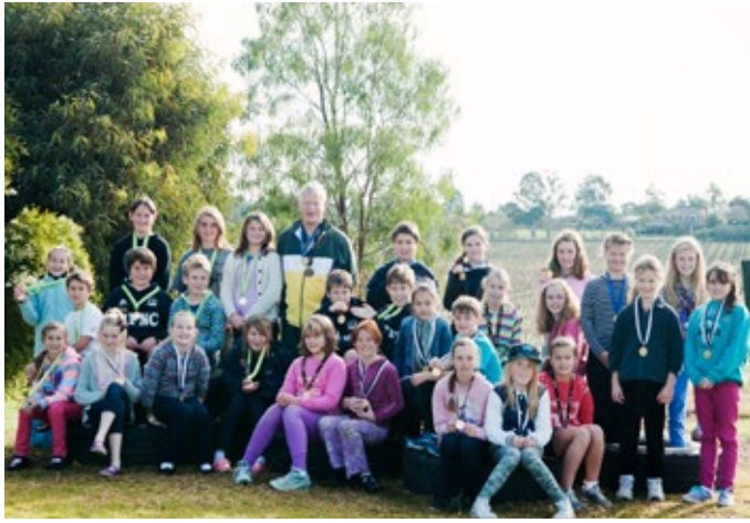
2013 St. Mary's Primary School, Rutherglen

The 2012 and 2013 Creative Catchment Kids writing program was showcased at the Seventh World Environmental Education Congress, held in Morocco during June 2013.