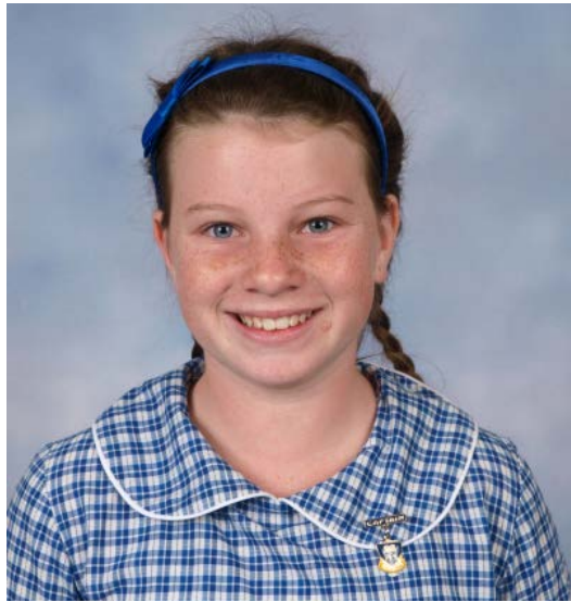
Eliza Prince Forbes Public School, Year 6 2015