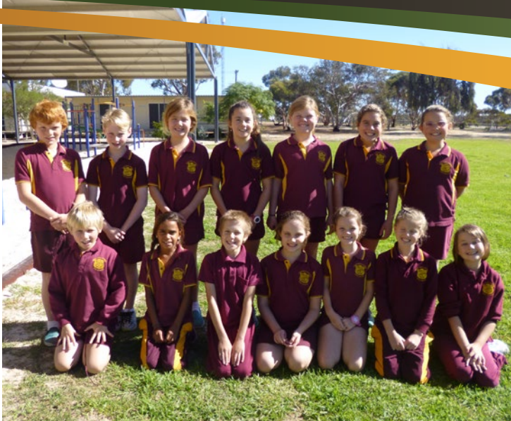
2015 Year 4/5, Narembeen District High School