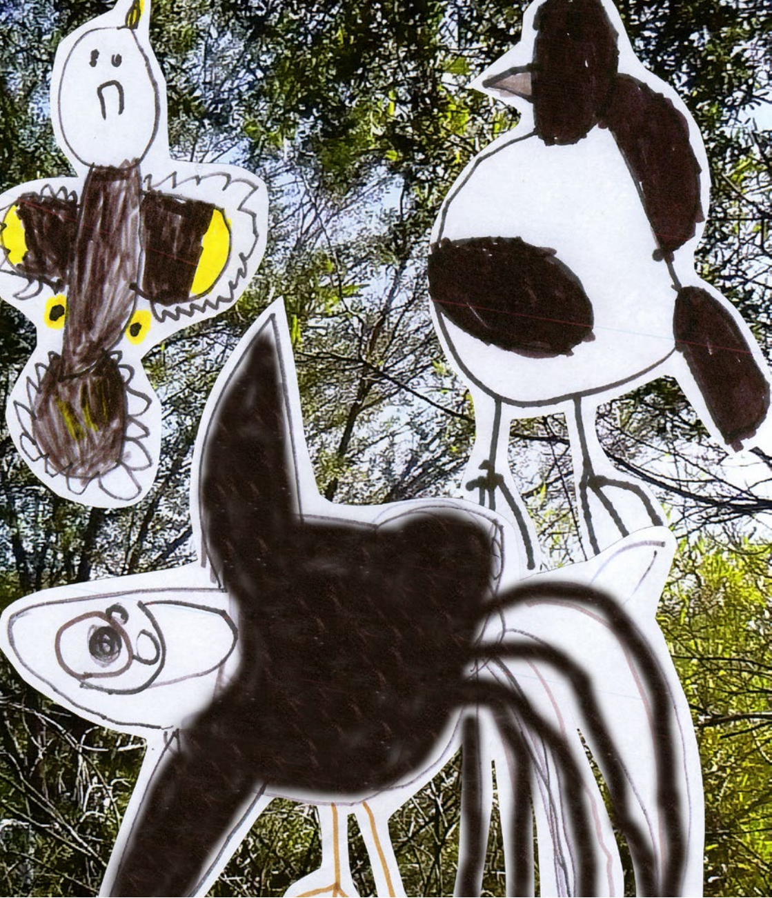
magpies, ravens and black cockatoos.