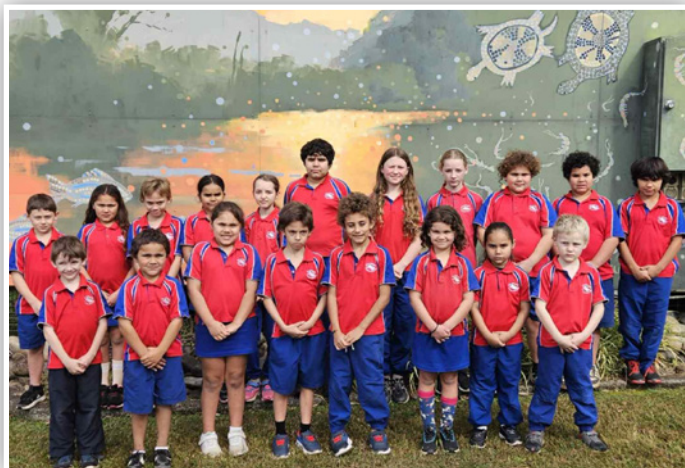
Bellbrook Public School, 2025